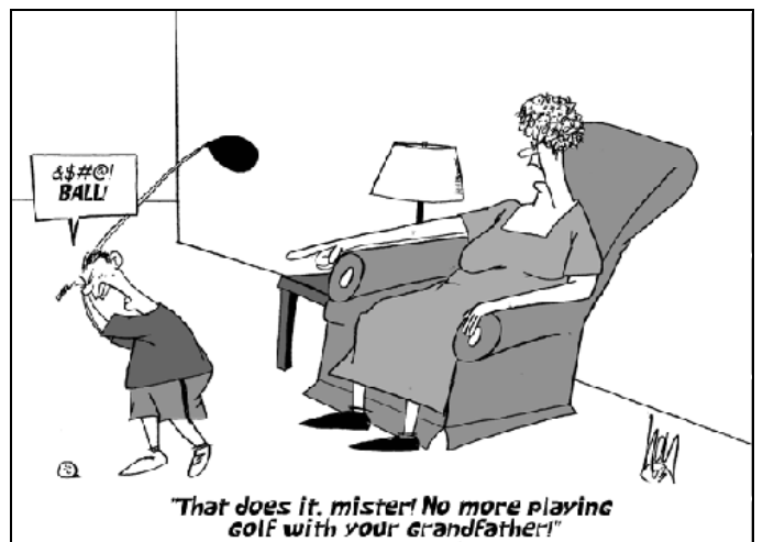
"That does it, mister! No more playing golf with your grandfather!"