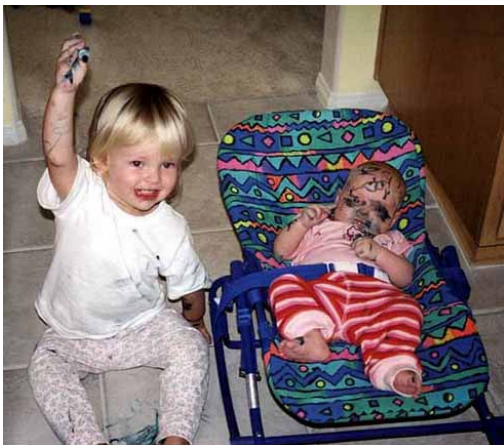
Look what I drew Nana!!