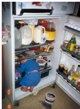
"What does Nana have in her fridge"