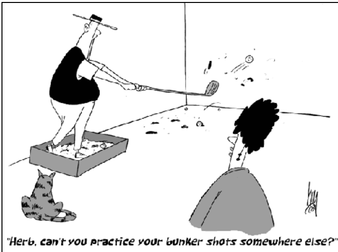
"Herb, can't you practice your bunker shots somewhere else?"