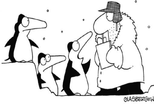
"All we eat is fish. Fish has no fiber. We're all constipated. That's why we walk funny!"