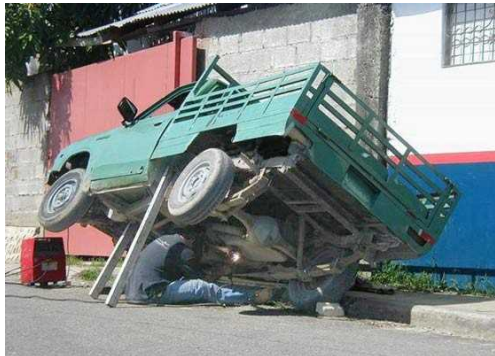
Why Women Live Longer Than Men

Market Thoughts are brought to you by Emmet & Mike Root Furniture Sales of Mid America 7305 Farnam Street, Suite 1 Omaha, NE 68114 Phone: 800-391-2166 Fax: 402-391-2383