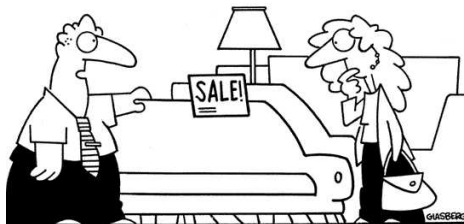
"This sofa is ideal for the home office worker. It folds out into a desk, file cabinet, fax machine, copier, scanner, printer, and computer."

A frog hopped into a bank, went to the teller window, and was greeted by Patty Black. The frog asked Patty for a sizable loan to fix up his pad. When asked for collateral, the frog produced a small trinket. Patty looked at the trinket and said "I'll have to clear this with the Bank President. When he saw the trinket he said, "It's a knick knack, Patty Black, give the frog a loan."