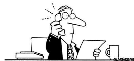
"Thank you for calling Customer Service. This call may be monitored so we can play it back to your mother if you're rude or use bad words."